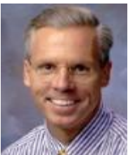
Professor and Vice Chair of Ophthalmology

SEPTEMBER – Current Concepts (In-Person) – 6pm-8pm