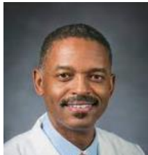
Professor of Ophthalmology Chief, Glaucoma Ophthalmology DUKE University, Durham, NC

Saturday, October 22, 2022 Loyola 5 th Annual Glaucoma Cataract Summit & Wet Lab