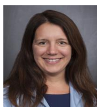
Assistant Professor of Ophthalmology – Optometry