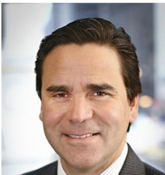
Associate Professor of Clinical Ophthalmology Cornea Service

Wednesday, November 16, 2022 Chicago Subspecialty Lecture Series-Refractory