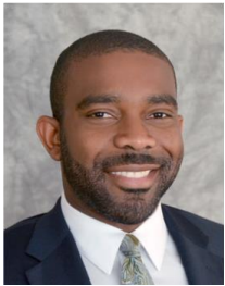
Assistant Professor UNIC School of Ophthalmology Durham, NC

Wednesday, November 2, 2022 Fall Diversity, Equity and Inclusion