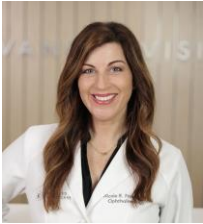
Cornea Fellowship Trained Anterior Segment Cataract Surgeon Advanced Vision Care, UCLA